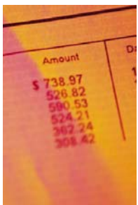
EXPLANATION OF BENEFITS

Insurance company sends summary of provider charges and insurance company payments to patient.