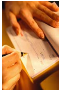
INSURANCE COMPANY PAYMENT